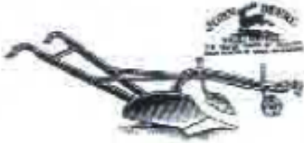
SYRACUSE CHILLED PLOW.

In the early years, before the tractor years, our crops grown were prepared by horses. The walk behind one furrow plow was a common tool. This plow was pulled by a team, cutting