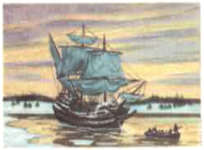
The "Mayflower" Landing at Plymouth

MAYFLOWER The Pilgrims who landed at Plymouth, Mass., in 1620 came from England in a sailing vessel. It was named the "Mayflower." The "Mayflower" left Plymouth, England, on September 17, 1620. Two months and five days later it reached Massachusetts Bay. After a month of exploring the coast, the Pilgrims founded their colony and named it Plymouth.